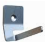
Double hook also deliverable